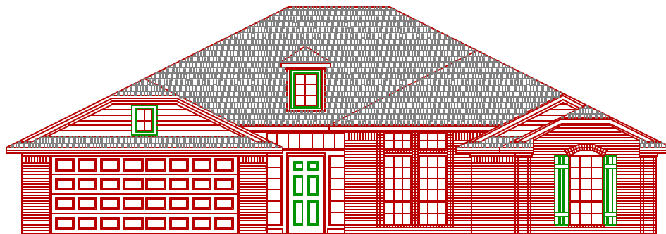
ELEVATION A (STANDARD)