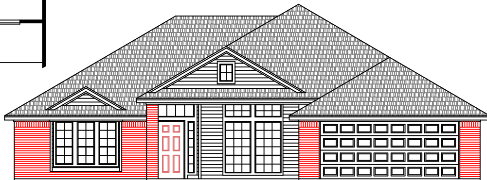
ELEVATION A (STANDARD)