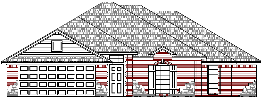
ELEVATION C (UPGRADE)