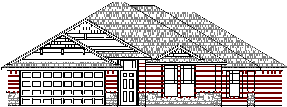
ELEVATION B (UPGRADE)