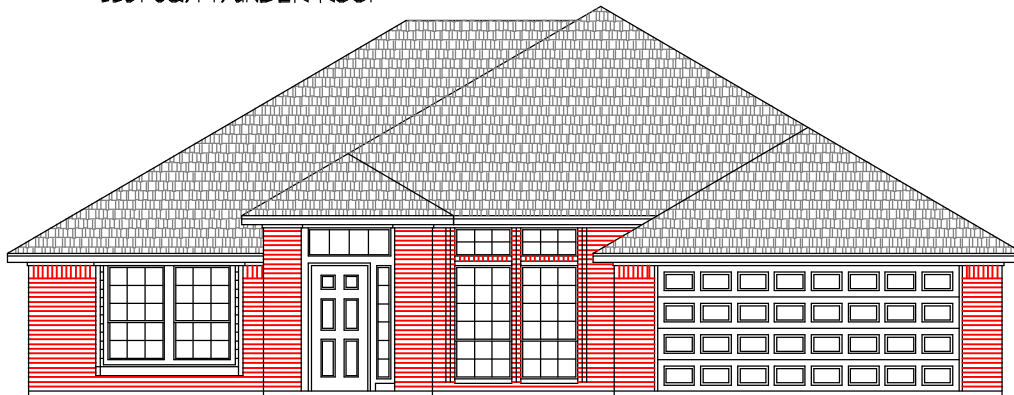
ELEVATION A (STANDARD)

1847 SQ. FT. LIVING AREA 2351 SQ. FT. UNDER ROOF