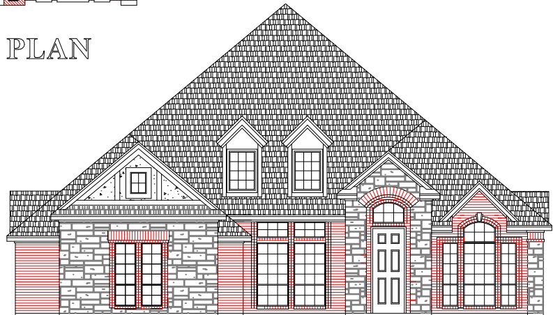
ELEVATION A (STANDARD)

LIVING AREA 2801 SQ. FT. TOTAL UNDER ROOF 3358 SQ. FT.