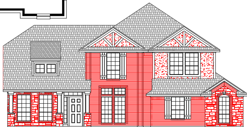
ELEVATION B (UPGRADE W/ STONE) SIDE ENTRY