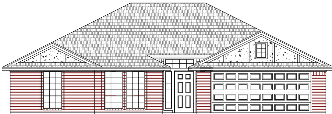
ELEVATION A (STANDARD)

1554 SQ. FT. LIVING AREA 2091 SQ. FT. UNDER ROOF